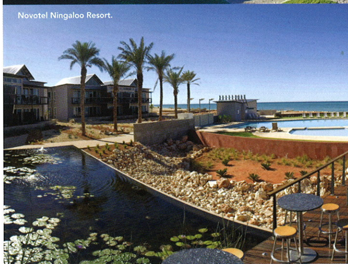
Novotel Ningaloo Resort.