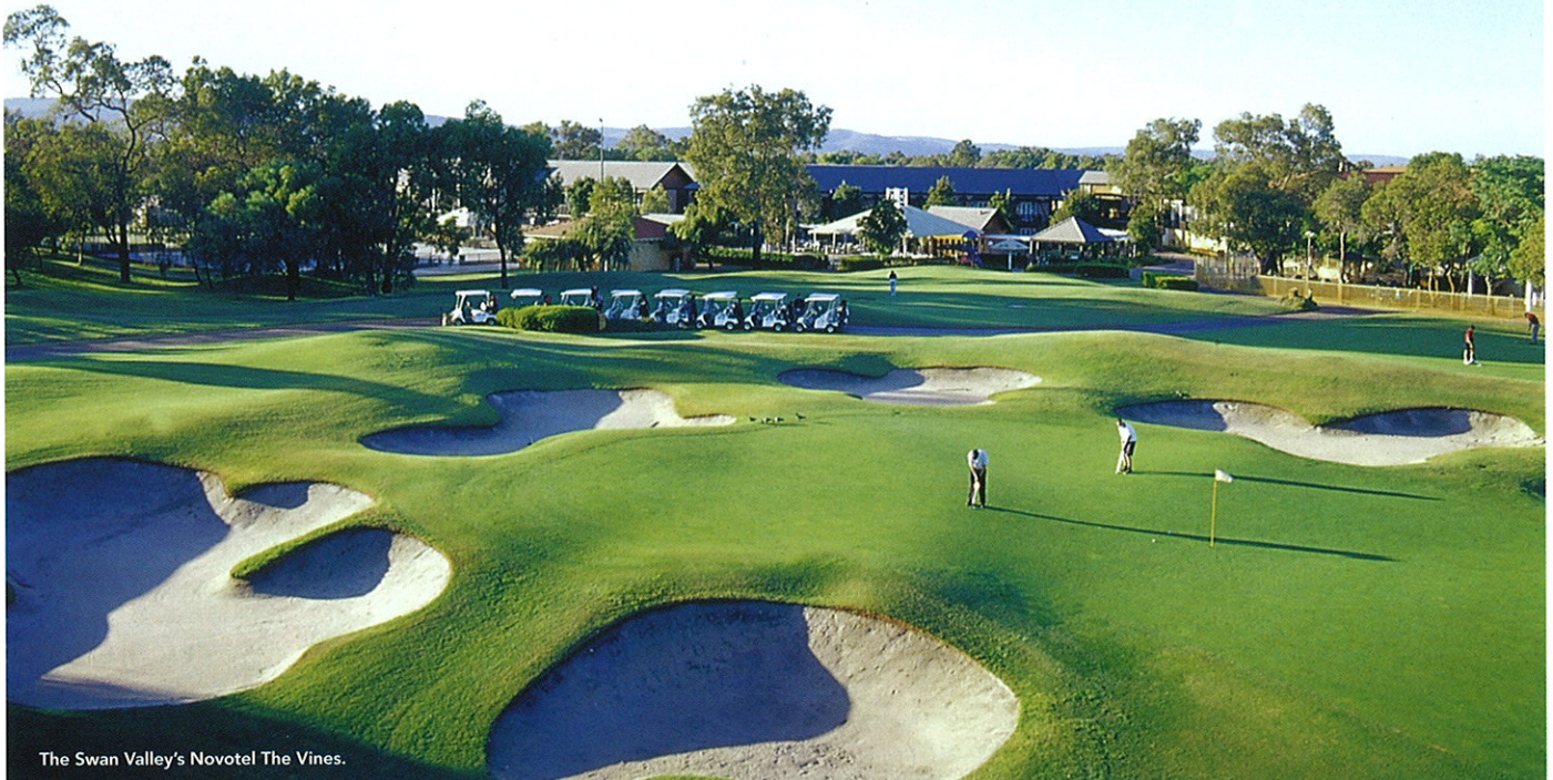
The Swan Valley's Novotel The Vines.

No matter where you take your delegates in Western Australia, there is a Novotel that can offer your group an unforgettable experience.